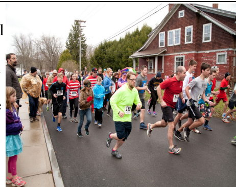
Start of 5K Joker Run/Walk 2016

August 1-6- Fliers are finished for our 34 th Annual Bike Trip. If you participated last year you will be receiving a form in the mail. The early registration deadline is July 15 and the cost for adults and returning bikers is $185.00. The cost for first time bikers under 18 is $125.00. Please include an additional $25.00 for the day at Water Safari so $210.00 for returning bikers and $150.00 for first time under 18. After July 15 add $20.00 per individual. There is also a final deadline of July 27. So get your registrations in along with the fee and notarized release forms for bikers under 18.